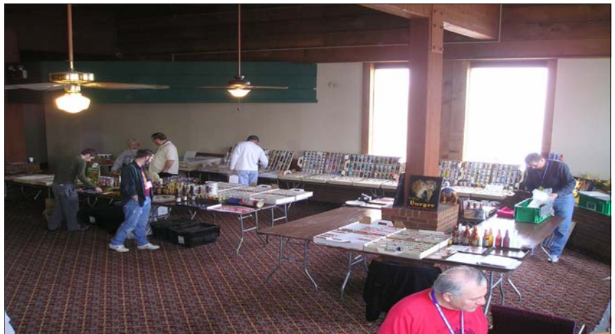
The upper level early on Saturday morning usually brings in collectors from all over the East coast and the rest of the country.