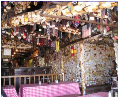
Above: Beautiful weather for an outdoor show saw the Pinnacle Peak mountain overseeing the days events. Below: Beer cans & cactus. Must be Arizona! Left & Right: The restaurant, homemade brews and the southwest atmosphere plus the A-1 Chapter's hospitality made for a memorable weekend.