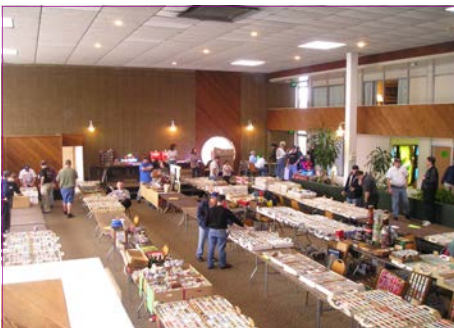
Above & below left, right: The main trade floor Saturday morning. A winter storm was freezing outside, but inside the collecting and deals were hot. The Hoosier Chapter produced an awesome raffle that offered many high quality prizes. Phil & John’s room, sported a huge Cook’s sign & advertisements.

Talk about a show on the rise! This years Hoosier Chapter spring show was expanded from a one day event, to an overnight show featuring a nice hotel with split level indoor rooms and atrium, perfect layout for room to room trading and most important—room to grow! The scene was South Bend Indiana with plenty of late winter “lake effect” snow flying to make any indoor event cozy. Several restaurants nearby, a lounge attached as well as a swimming pool. This expanded version was launched with collectors arriving from all over the region to include the east coast. Several highly prized and very rare on-grade beer can collectibles turned up at this show including 2 Argonauts , an Apollo , Jester , Cape Cod and an ultra rare Autocrat ! Plenty of other breweriana was on hand as well. Including our very own John Coughanowr and Phil Douglas’ room. The two had huge signs draped over the railing and some taller than the hallway! Plus a room filled with some of the toughest advertisement pieces in the state of Indiana.