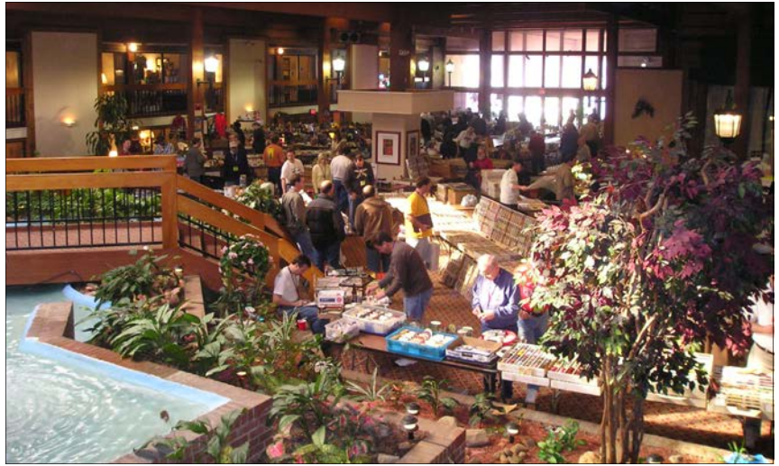
The indoor atrium of the Ramada Inn makes for a great trade floor. There is also an upper level in sections that fill up on Friday and Saturday. During the week room to room trading is virtually 24 hours a day.